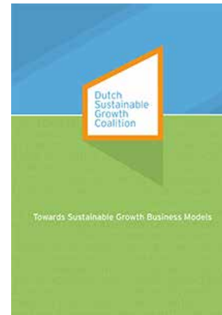
Towards Sustainable Growth Business Models (2012)

For more information, please visit the DSGC section on www.vno-ncw.nl/DSGC .