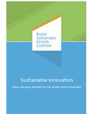
Sustainable Innovation - Game changing solutions for the world's grand challenges (2014)