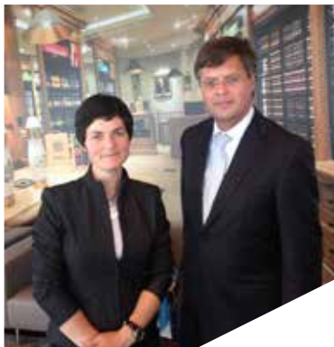
Ellen MacArthur and Jan Peter Balkenende

“In a true circular economy, consumption happens only in effective biocycles; elsewhere use replaces consumption. Resources are regenerated in the biocycle or recovered and restored in the technical cycle. In the biocycle, life processes regenerate disordered materials, despite or without human intervention. In the technical cycle, with sufficient energy available, human intervention recovers materials and recreates order, on any timescale considered. Maintaining or increasing capital has different characteristics in the two cycles.”