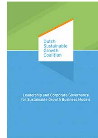
Leadership and Corporate Governance for Sustainable Growth Business Models (2013)